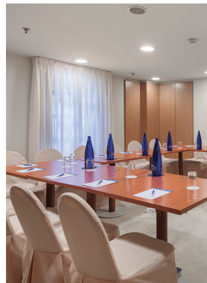
PALMARÉS MEETING ROOM